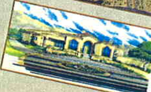
Custom Home - offered at $1,495,000

Richard Felker and Lou Alton Realty, developer and builder of the spectacular 16,000 square-foot residence profiled in Professional Builder magazine, are pleased to build several of The Sanctuary's most impressive homes. They are joining with RSL & Associates Custom Homes to build two new residences in the mountainside community, including a 5,000-square-foot home, priced at $1.25 million, and a 6,100-square-foot residence that carries a $1.45 million price tag.