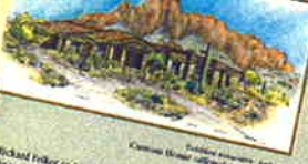
Custom Home - offered at $1,250,000