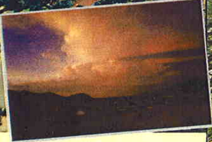
At The Sanctuary, The Empire Group created a one-of-a-kind neighborhood featuring 16 custom homesites in Arizona's most exclusive address - Paradise Valley. This mountainside community overlooks Camelback and Mummy Mountains, and has outstanding views of the city lights.